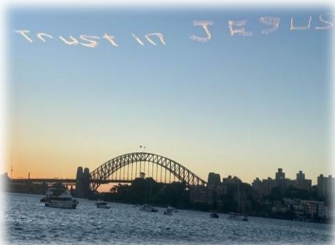
Seen in the sky above Sydney in January 2022

course and we will find one another again in the same place. We shall never be separated, for we live for Christ, and now we are united with Christ as we go toward him...we shall all be together in Christ" (CCC1690)